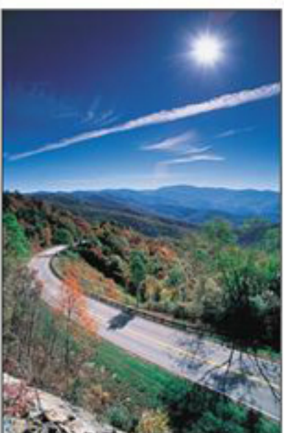
Skyscape over Autumn Colors on the Cherohala Skyway (TN) [3]

The northeastern corner of the United States hosts some of its greatest drives. In Connecticut, both Connecticut State Route 169 and Merritt Parkway will show you the New England experience. Each drive combines early American history with lovingly preserved natural landscapes. West Virginia's Highland Scenic Byway lures you into some of the wildest parts of the state, including wetlands, hardwood forests and cascading waterfalls across a jumble of rolling hills. Visit world-famous lighthouses and historic war sites on the Seaway Trail in northern New York, along with such varied destinations as Niagara Falls, Boldt Castle, or the Adirondack Mountains. If you are lucky enough to visit in autumn, round out your tour of the Northeast on the Kancamagus Scenic Byway , and witness the fall foliage splendor of New Hampshire's White Mountains.