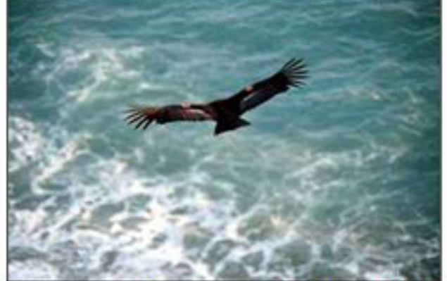
Condor Taking a Shoreline Flight (CA) [8]

California added two famous drives to the list. Tioga Road/Big Oak Flat Road bisects the nation's first federally protected land: Yosemite National Park. Here unrivaled views, outdoor activities, and geological marvels await just off the paved pathway. Finally, on the matchless California coastline you'll find yourself gazing off into the deep blue Pacific while traveling the Big Sur Coast Highway . Wild and remote even today, the coastline is home to rare wildlife and crashing surf, as well as centuries of Native American, Spanish American, and modern American culture.