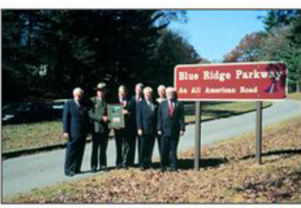
Standing by the Blue Ridge Parkway in 1996 (NC) [1]

September 2006 marks the tenth anniversary of the designation of the first National Scenic Byways and All-American Roads. Since 1996, the program's noteworthy America's Byways, which at present number 126, have brought travelers to some of the nation's most intriguing locales. In the beginning, the program consisted of just twenty of America's finest routes. Today, these classic drives offer new adventures in addition to the qualities that earned them their status as America's Byways. Wherever your travel plans take you, chances are you won't be far from one of the original National Scenic Byways and All-American Roads.