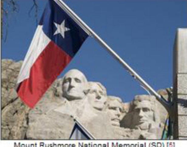
Mount Rushmore National Memorial (SD) [5]

keep a safe distance away from its thriving wildlife, which includes sharp-toothed alligators and colorful rare birds. Alabama's first scenic byway tells the harrowing and inspirational tale of the Civil Rights Movement. Trace the path of 500 marchers led by Dr. Martin Luther King in 1965 on the Selma to Montgomery March Scenic Byway , and marvel at the unshakable collective will of protesters who marched through beatings, tear gas, and mockery in pursuit of equal voting rights.