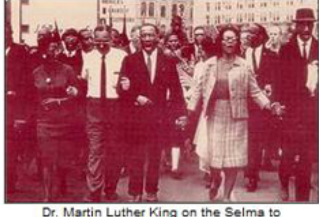
Dr. Martin Luther King on the Selma to Montgomery March, 1965 (AL) [4]

In the Deep South, explore the rich wetlands of Creole Nature Trail in Louisiana. You'll find plenty of thrills as you marvel at, photograph, and