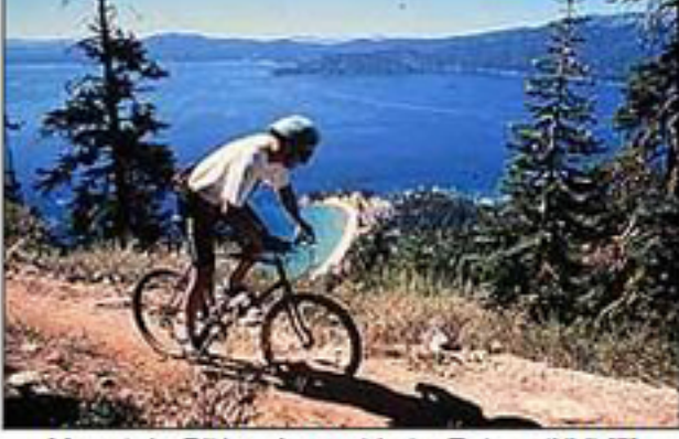
Mountain Biking Around Lake Tahoe (NV) [7]

The Southwest nominated some jewels of their own, including Pyramid Lake Scenic Byway and Lake Tahoe - Eastshore Drive . Guiding you through arid Nevada landscapes, both offer their own unique take on the state's treasures. Pyramid Lake Scenic Byway claims the distinction of being the only National Scenic Byway located entirely on tribal reservation land, making it a journey of culture and wonder. Drive Lake Tahoe - Eastshore Drive and discover the beauty of this renowned mountain lake on the Nevada/California border.