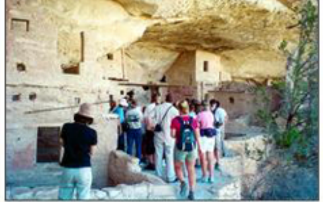
Balcony House At Mesa Verde National Park (CO) [6]

September of 1996 was a good year for Colorado Scenic Byways, as three famous routes received national designation. Starting